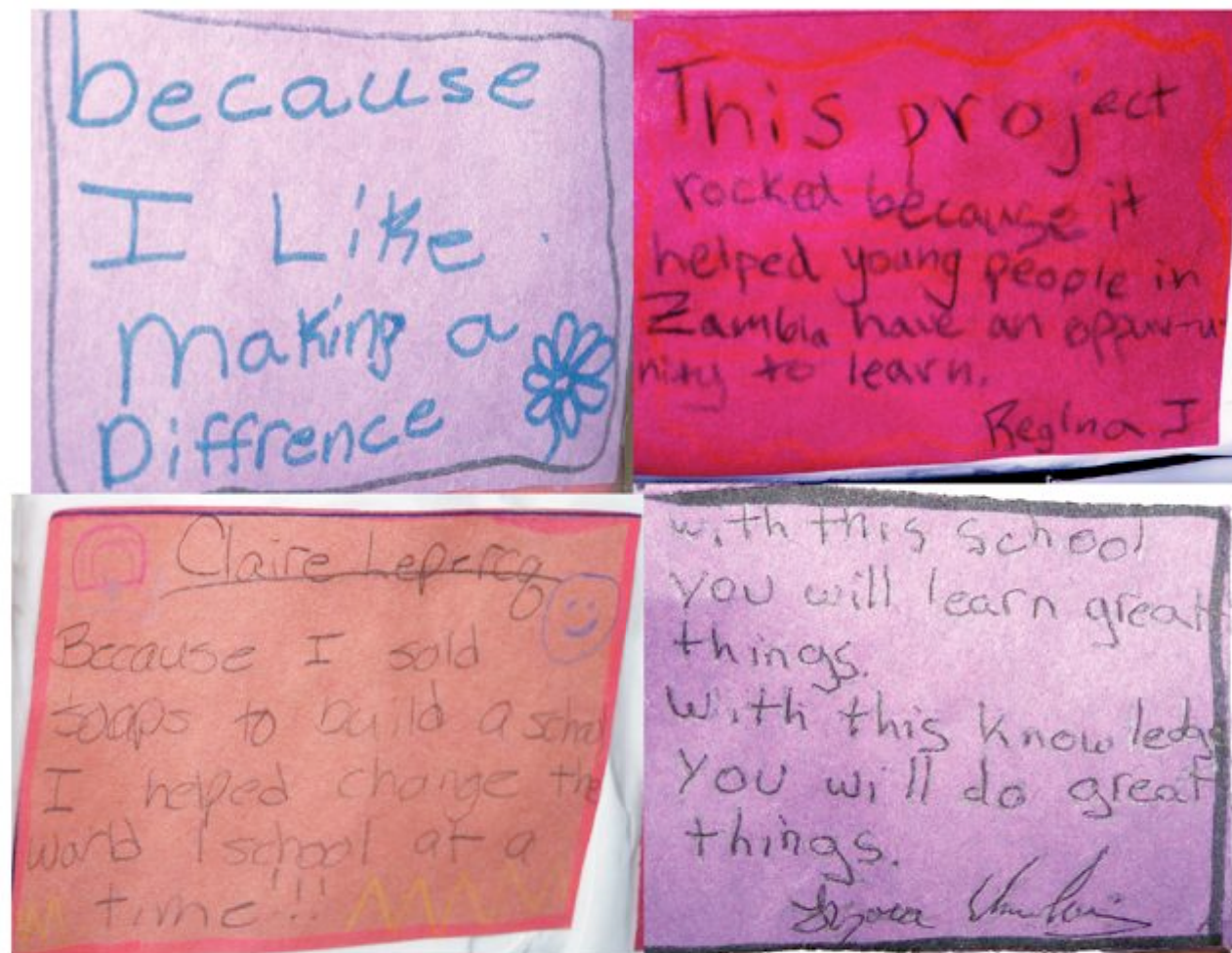
Quotes from students at Louisville Middle School in Louisville, CO, whose fundraiser earned enough to build two schools in rural Zambia.

FEW FUNDRAISERS FOR SCHOOLS give teachers and students the ability to make a real difference in the world beyond their own communities. Take the opportunity to be involved in this exciting venture, and you will teach your students lessons that last a lifetime.